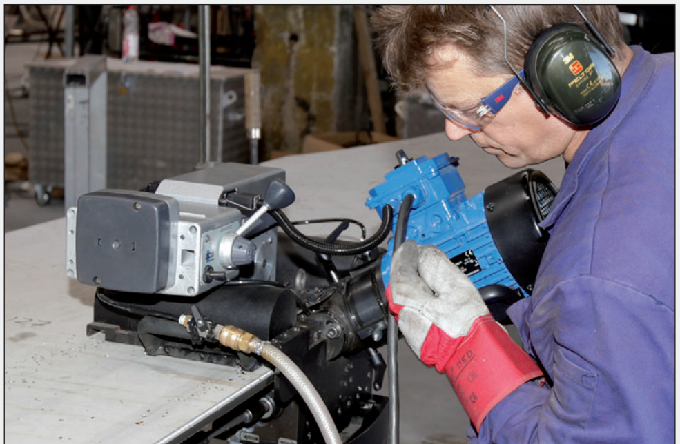
The AutoCUT 500 with automatic forward and return