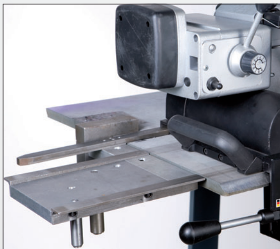
AutoCUT 500 guide rails