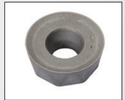
Carbide reversible disk SHM 400