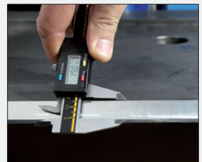
Chamfer width 30 mm max.