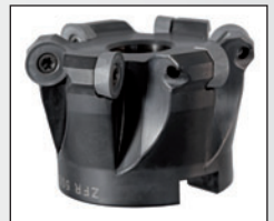
Arbor milling cutter ZFR 500

1 set = 6 carbide reversible disks SHM 400