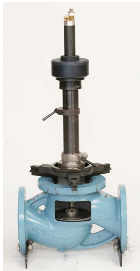
TSV-150 with jaw chuck