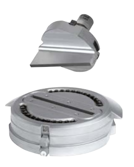
Slitting tool MultiShear.