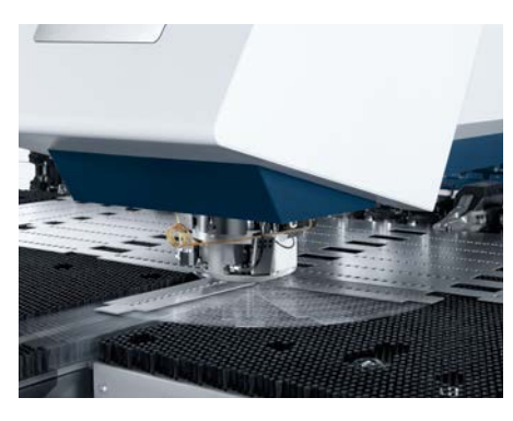
If necessary, the machine can turn your parts before unloading.