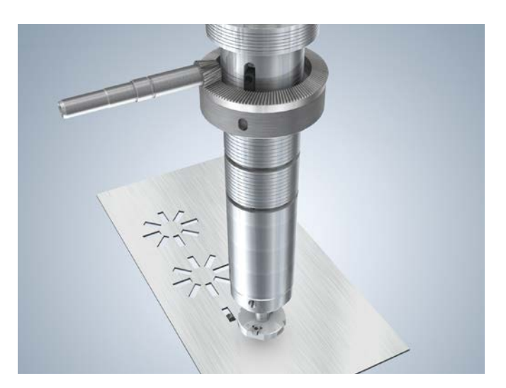
Thanks to 360° rotation, you can punch at whatever angle you like.