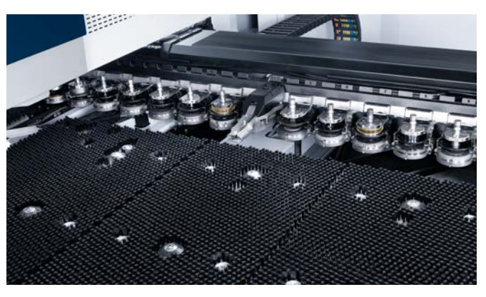
Brush tables for a gentle material handling.