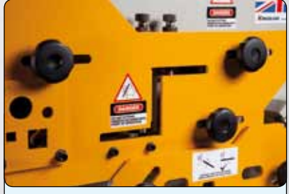
• Angle Station Cropping angle iron is possible for every angle between 45° and 90°, both internal and external.

• Section Cutting Station The machines are fitted as standard with blades for cutting round and square bars. With extra equipment in this aperture, the machines are able to cut channel, beams or joist, T-section and many other special profiles.